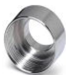
Step-up adapter, M32 to M40, including O-ring

Extension adapter - ENLAR-M-KV-M32/M40 - 1647682